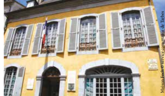
Maison Foch - service com. mairie de Tarbes