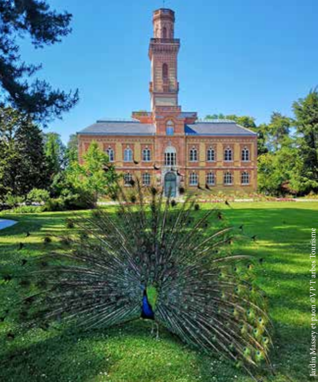
Jardin Massey et piano